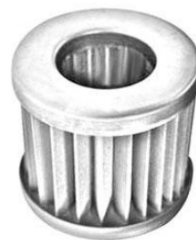
Pleated Oil Filters